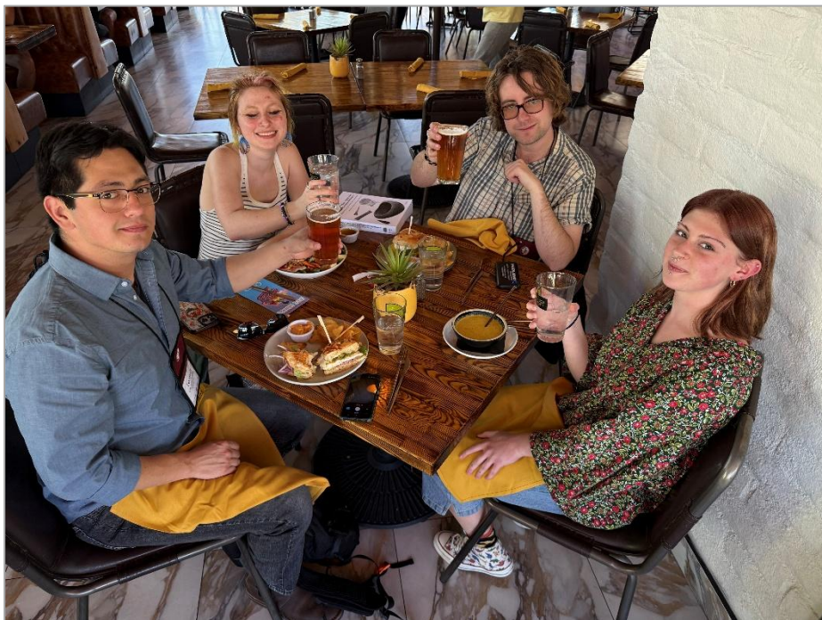
UCSC Students enjoying a meal at the SCA Conference in Palm Springs.