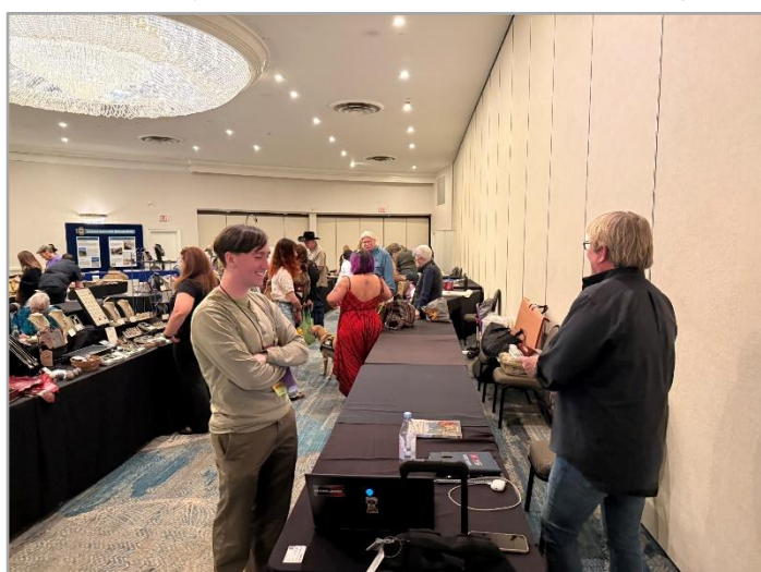
The bookroom at the conference.

The conference was very inclusive for new students, and this year, the entry fee covered access to the silent auction, allowing all students to wander around poolside, jump in the water if they wished, and meet archaeologists in a less formal setting. The conference was