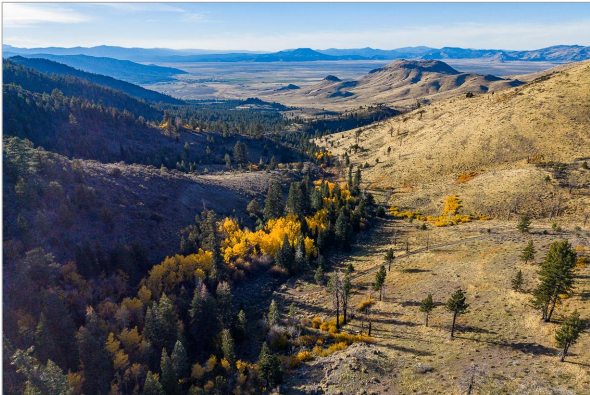
The Wélmelti Preserve