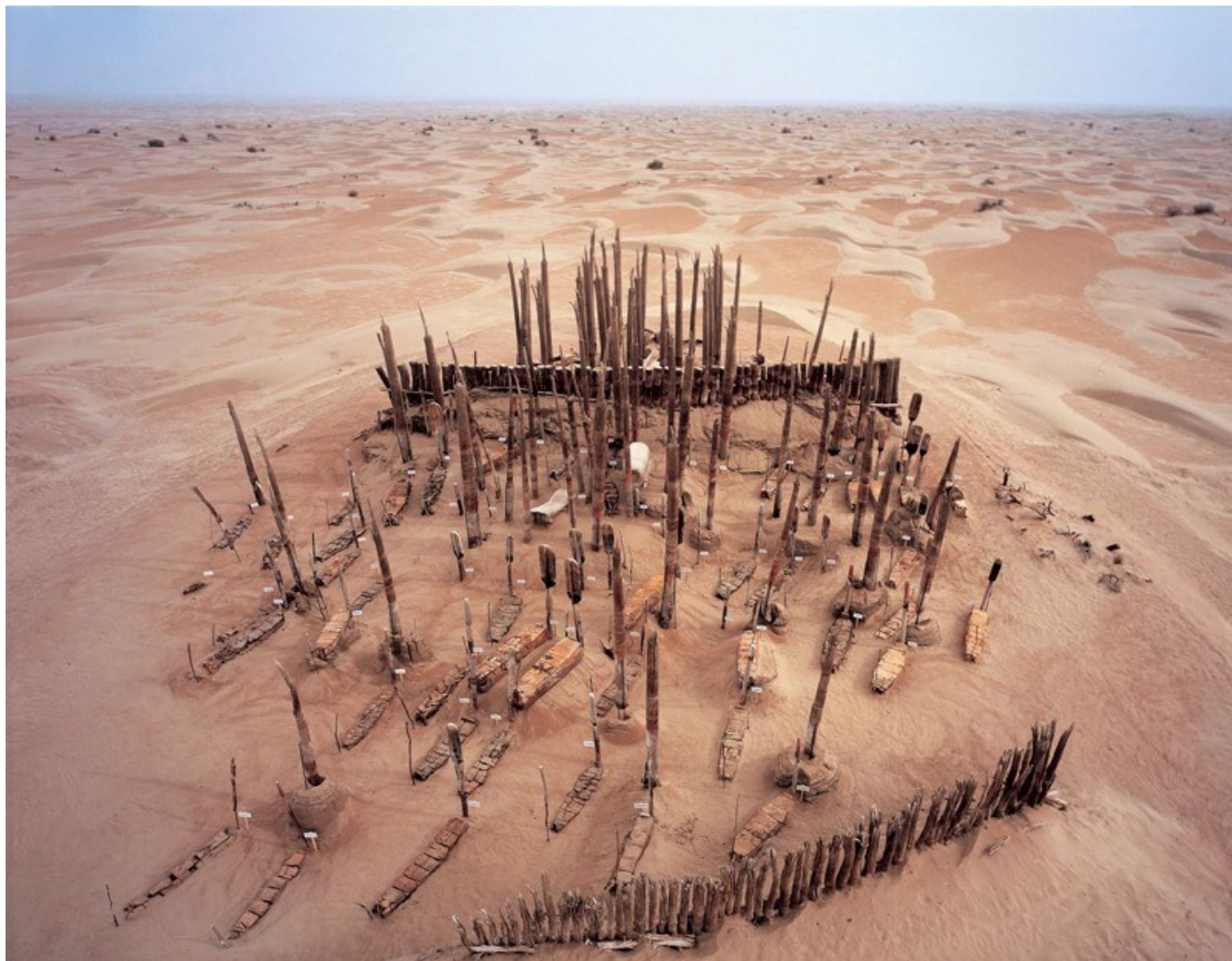
Cemeteries in the Taklamakan Desert, China, hold human remains up to 4,000 years old.

The genomes of 13 remarkably preserved 4,000-year-old mummies from the Tarim Basin suggest they weren't migrants who brought technology from the west, as previously supposed.