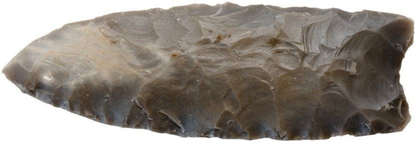
A stone point made by the Clovis people. They were once believed to be the first Americans

"Footprints aren't like stone tools. A footprint is a footprint, and it can't move up and down [in the soil layers]."