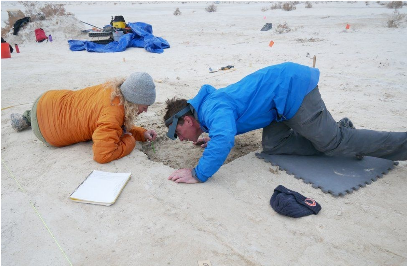
Team members record the seed layers above the prints

These big game hunters were thought to have crossed a land bridge across the Bering Straits that connected Siberia with Alaska during the last ice age, when sea levels were much lower.