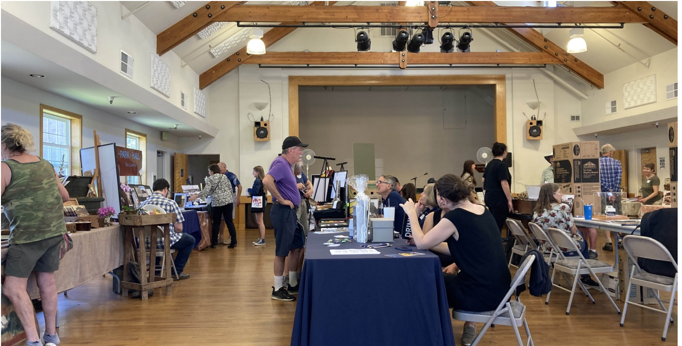
Twenty five organizations took part in this year's Santa Cruz County History Fair.