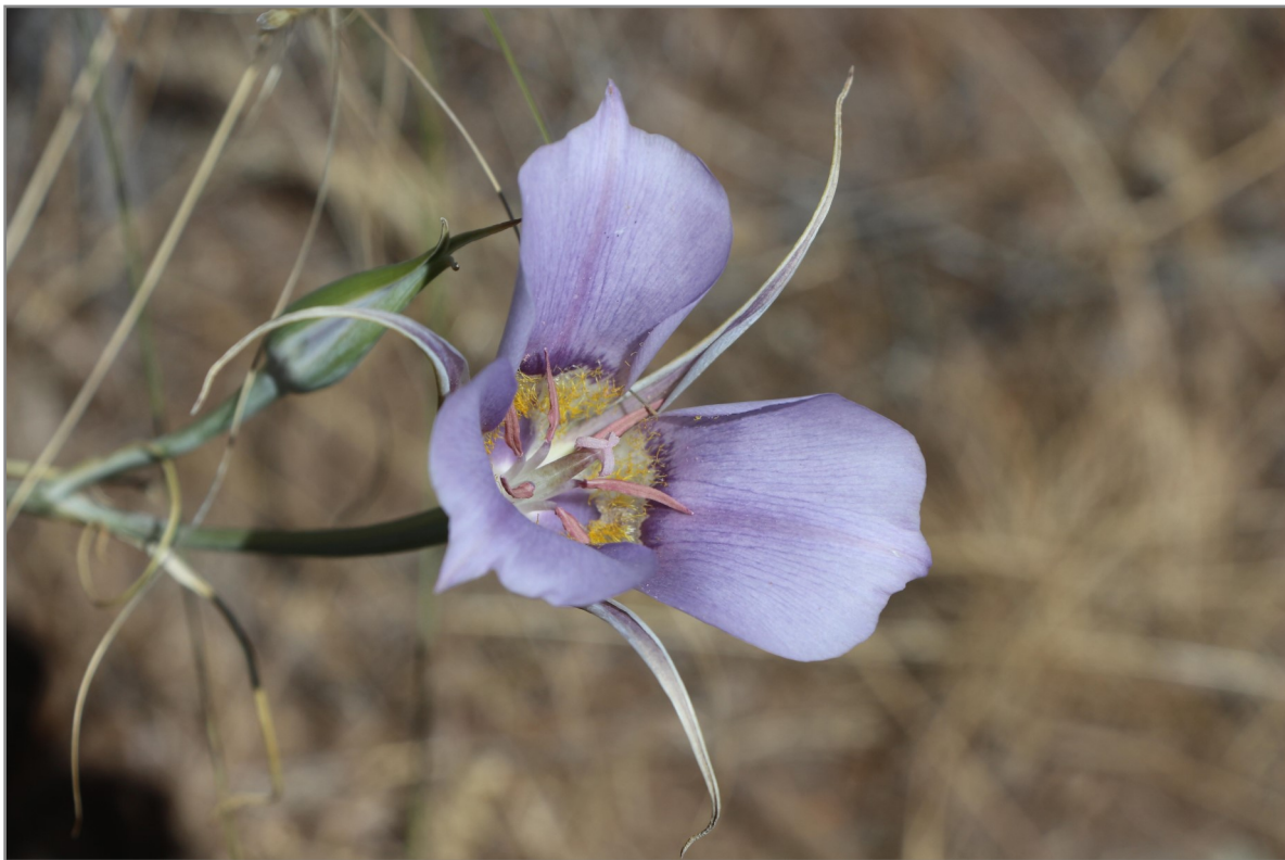
Sagebrush Mariposa Tulip