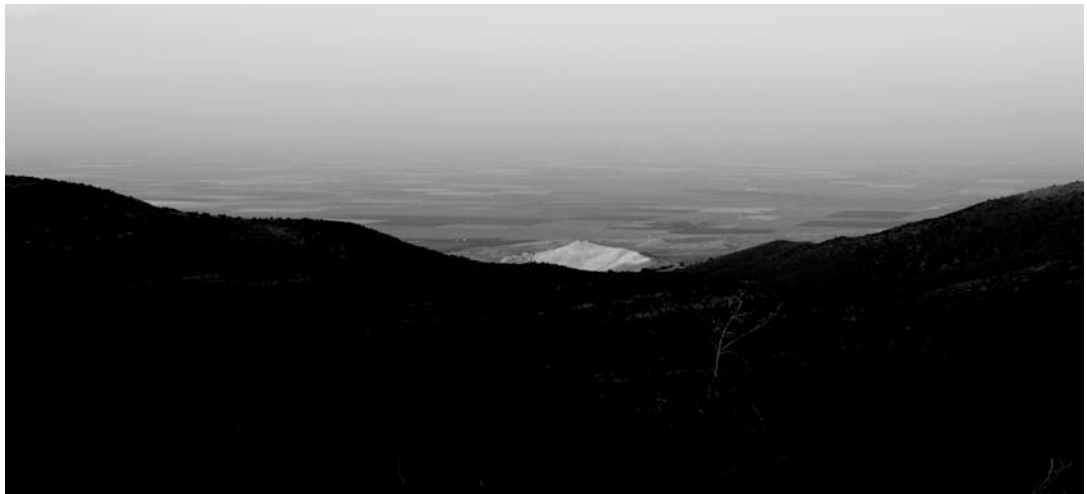
Phenomenon of Light on the Distant Hill as Evening Falls

religious rituals. They carefully visit two sites . . . monitored celestial progressions