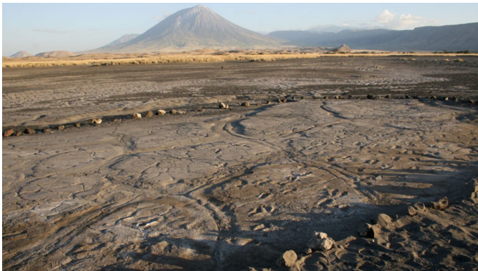
Ol Doinyo Lengai, and the Engare Sero footprints, (first published in the SCAN Summer 2020)

are some recent reports from Africa, the UK, and the Americas.